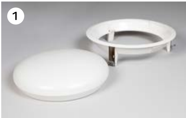
1 Recess ring and luminaire consisting of LED module, diffuser and body.

A large number of luminaires installed in often difficult-to-work spaces require efficient installation. Discover Evo is one of the quickest on the market. An innovative installation solution with body and recess kit provides a user friendly light package. The LED module and diffuser are placed together which makes the installation smooth and safe as the lighting element can be put to one side while the body is being installed.