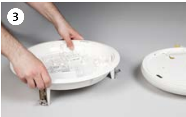
3 Place the luminaire body in the recess module and lock it with a click.