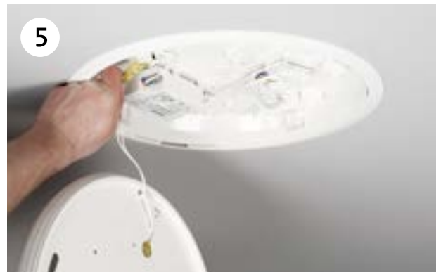
5 Attach the safety wire and connect the snap-in connector. Install the light unit in the body using a bayonet fitting.