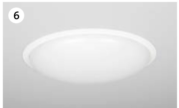
6 The installation is complete. Switch on the luminaire.