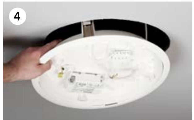
4 Draw the cabling into the luminaire and release the three locking springs. Install the luminaire in the hole.