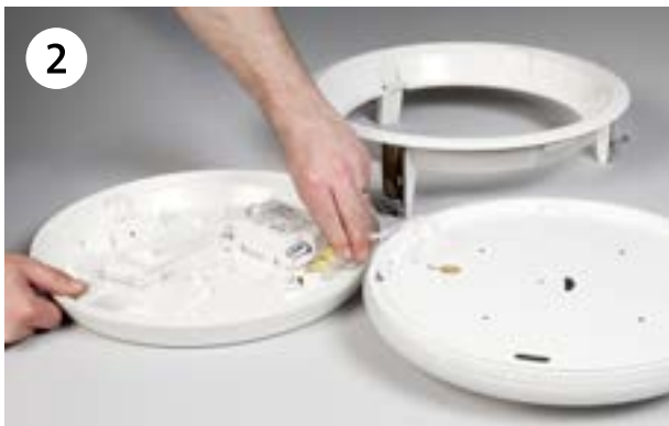
2 Separate the light unit and body.