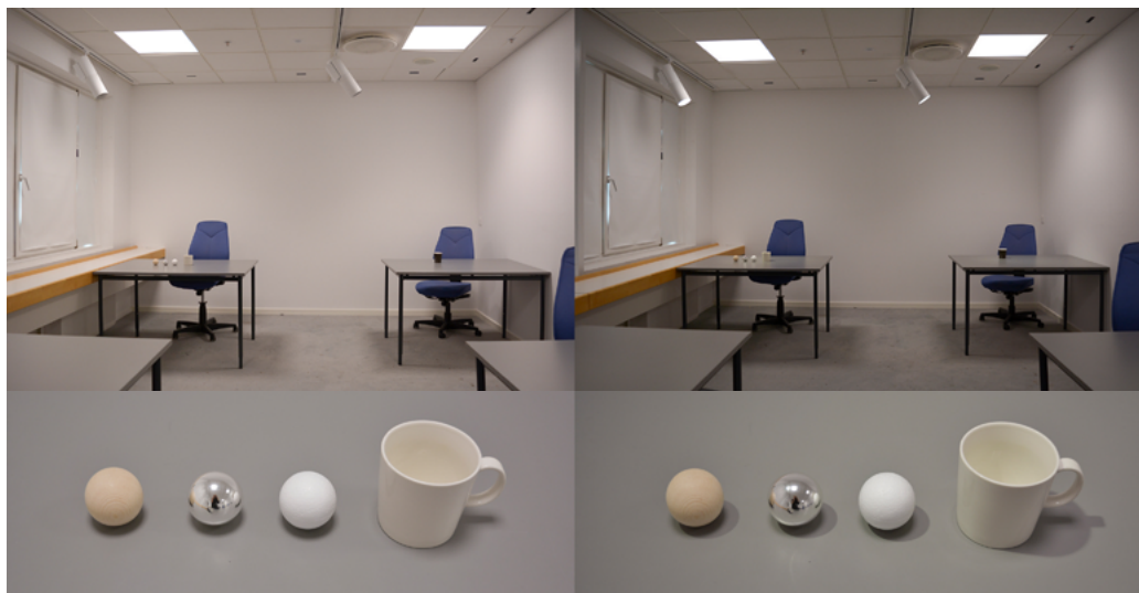
Fig. 1: The two photographs are showing the visual appearance of the space and difference of light modelling of objects with only diffuse lighting 0:100 ratio (on the left) and 45:55 ratio of direct:diffuse lighting (on the right). See Research Paper 3.

In the last stage of the project, a field experiment with seven different light settings were implemented in an office environment with four participants working there over a four months period. The effect on the perceived atmosphere, visual comfort and work engagement were compared to static lighting. Advanced lighting technology was utilized, using live sky-scanner data and illuminance sensors to determine the sky condition and appliance of the designed lighting settings, depending on illuminance levels and the sky-type. See Research Paper 4. The convergent parallel mixed method approach with interviews and questionnaires revealed several findings in favour of Double Dynamic Lighting, in comparison to static lighting.