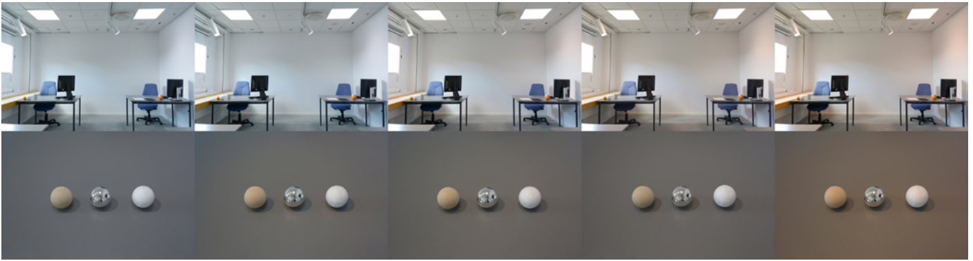
Fig. 2. Registrations of 5 different lighting settings, illustrating the light distribution and perceived CCTs of the space and of objects on a work desk. See Research Paper 3.